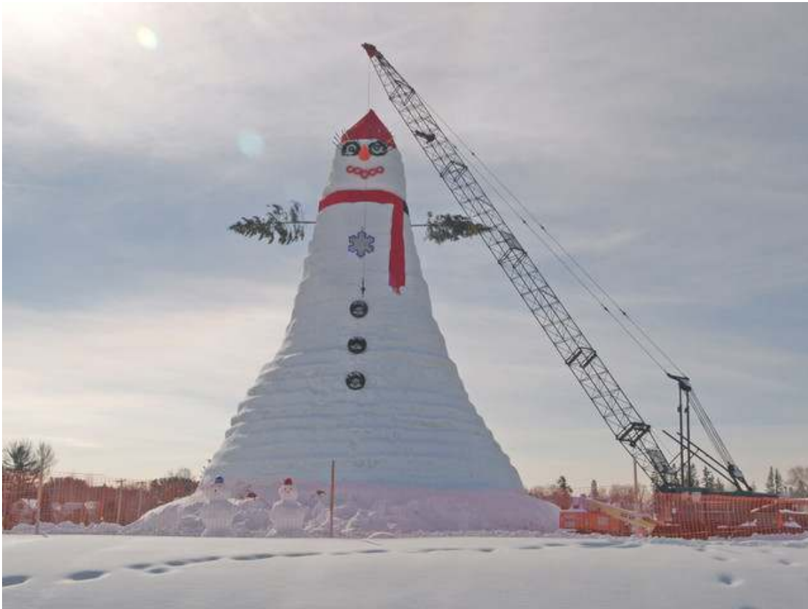
World's Largest SnowWoman, Bethel, Maine She stands at 122 feet and is named "Olympia," for Maine Sen. Olympia Snowe